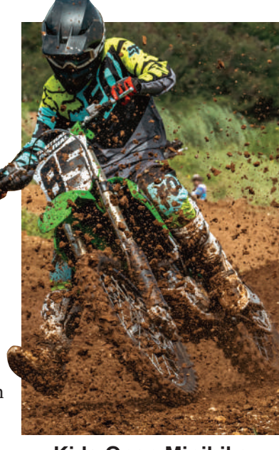
Kids Open Minibike